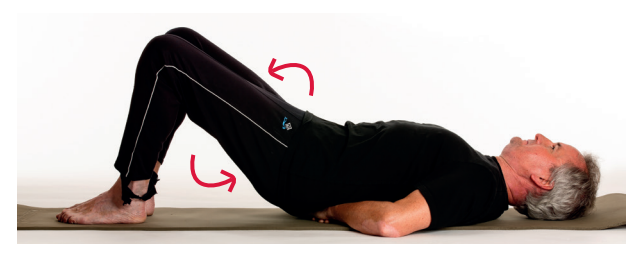
Note. © Hollister Inc. Reproduced with permission.

Physiotherapists in consultation with the surgeon and or an NSWOC can help individuals with an ostomy progress exercises as appropriate, for the safe return to an active lifestyle. Strong abdominal muscles and good core strength may help decrease the chance of an individual with an ostomy in developing a parastomal hernia.