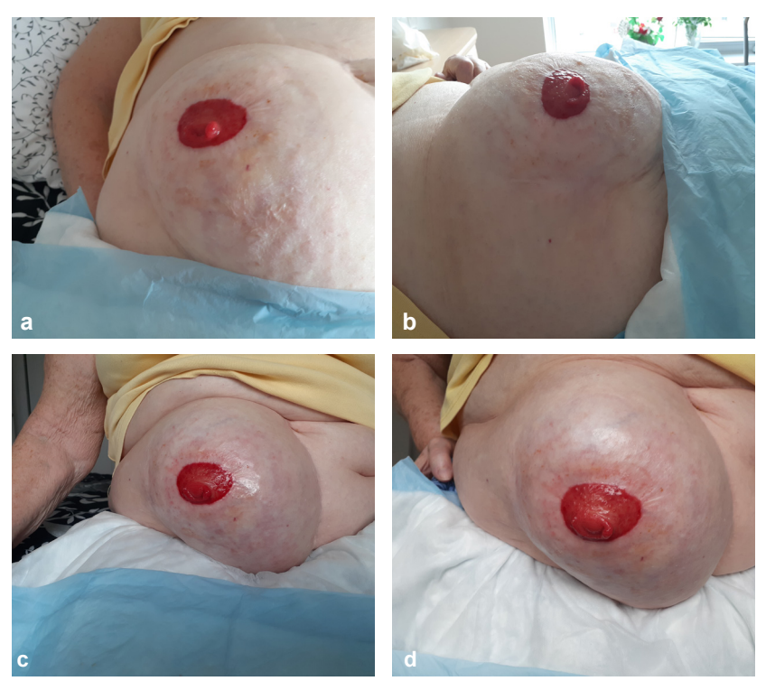
Figure 5 Parastomal Hernia in Various Positions

Note . a) a lying front view of a parastomal hernia; b) a lying side view of a parastomal hernia; c) a sitting front view of a parastomal hernia; d) a standing front view of a parastomal hernia.