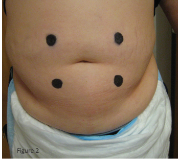
Figure 1 - This photograph is an example of the four quadrants marked in a sitting position. The marks in the upper quadrant are more within the patient's line of vision. Figure 2 – This shows how the marked positions of four quadrants look different when the patient is standing on the same patient.