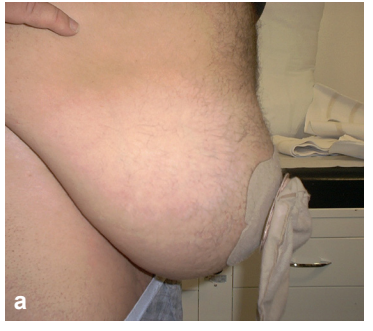
Figure 4 Parastomal Hernia Pre- and Post-Application of Hernia Belt With Opening

The use of abdominal supports is one of the components reported to reduce the incidence of parastomal hernia.<sup>1,2</sup> It is imperative to work collaboratively with at risk individuals to determine the best support garment which meets their personal needs, body types and preferences. The use of belts is individual. Not all individuals will need or want a support belt.