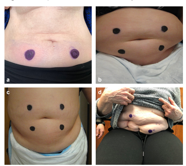
Figure 1 Preoperative Stoma Site Marking on the Abdomen<sup>25</sup>

Note. a) marking bilateral lower quadrants; marking four quadrants in b) sitting; c) standing; d) marking a challenging abdomen.