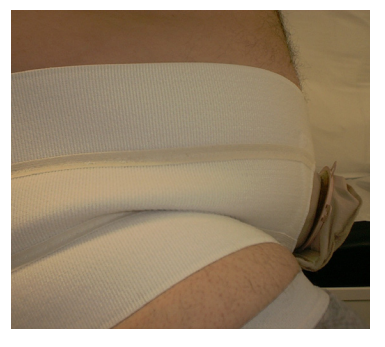
Note. a) side view of unsupported hernia; b) front view of hernia supported with hernia belt; c) side view with support.