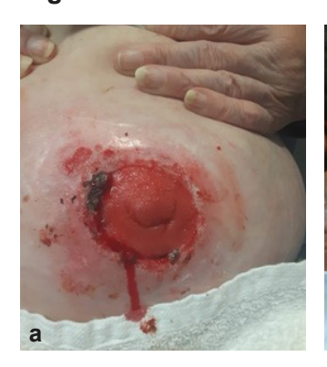
Figure 7 Peristomal Skin Trauma From a Parastomal Hernia